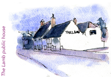
The Lamb public house