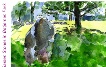
Sarsen Stones in Betjeman Park

walls' mentioned in one of John Betjeman's poems. Cross the Brook by the iron bridge and enter the Betjeman Millennium Park, pausing to read the boards explaining Betjeman's link with Wantage and the beautifully carved extracts from his poems, strategically placed by the paths.