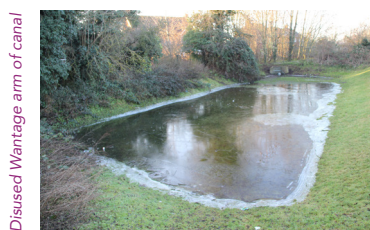
Disused Wantage arm of canal

signposted "Oxfordshire Circular Walk", leading off the road along the old track of the Wantage arm of the Wilts and Berks Canal, which takes you diagonally through the housing estate past Mably Grove to Elizabeth Drive.