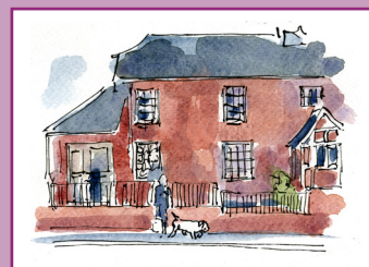
Vale & Downland Museum

This walk begins at the Vale and Downland Museum, well worth a visit in its own right. The building, a 17th century merchant's house, contains permanent local history galleries including interactive media and films, temporary exhibition areas, a Tourist Information Centre, a shop and an excellent café for lunches, snacks, drinks and home-made cakes – just the thing to fuel your walk or reward you afterwards! Do check opening hours before you go.