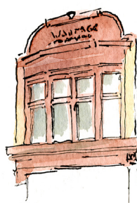
Wantage Tramway Office