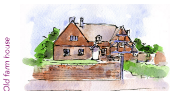
Old farm house

2 Look left at the old farm house – a timber frame yeoman farmhouse with herring bone design, initials AC above the centre top window.