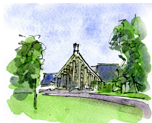
St John the Baptist Church

7 Pause on the Green by the Millennium Stone, erected on 1st January 2000, depicting transport through the ages.