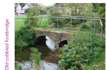
Old cobble footbridge

Follow the brook downstream, walking on the grass to the next (cobbled) footbridge.