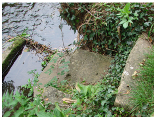
Old stone steps

5 Return to the cobbled bridge and cross onto the Green. See the Old Post Office to the right across the road, also Rowan Cottage which was the “poor house” and in 1828 became part of the Wantage Union. It stands on the former Village Green, which then covered both sides of the road and has since been much encroached.