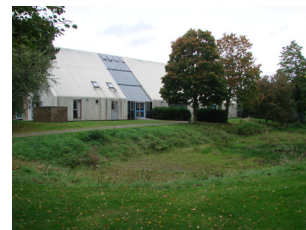
Old Mill Hall

13 Finish the walk by crossing over and walking up School Lane past the balancing ponds to Old Mill Hall.