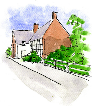
Old Post Office

6 Follow the tarmac path across the Green towards the bus shelter.