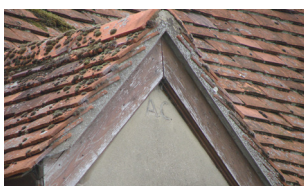
Farm house roof detail

Turn right (east). Continue to Bay Tree public house on the right. The present Bay Tree pub (1895) is next to the site of the old one which was a thatched building on the left.