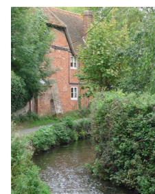
Brook Farm House

4 On our left is Brook Farm House with its surviving timber-framed pigeon house in the